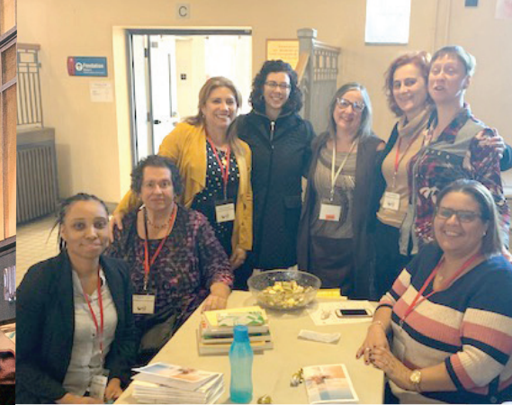
L'ÉQUIPE DE L'ODEF