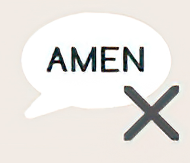
Refrain from saying "Amen" out loud