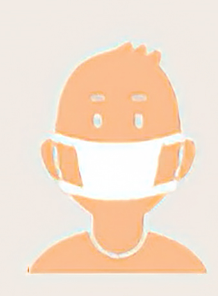
Put your mask back on