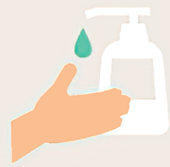
Sanitize your hands