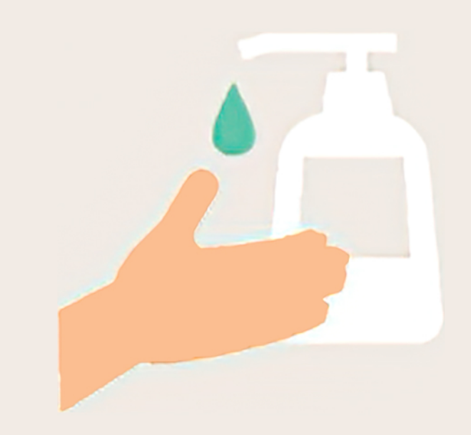
Sanitize your hands before entering and leaving