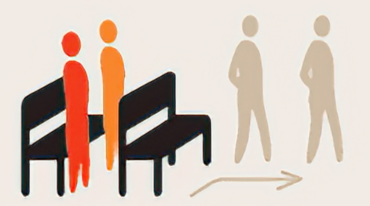
Proceed one pew at a time