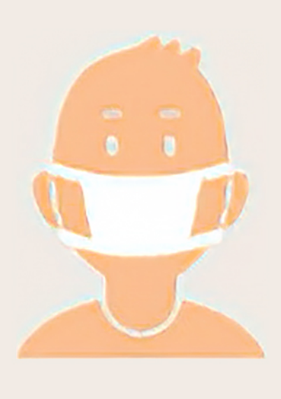
Wear a mask when distancing is not possible